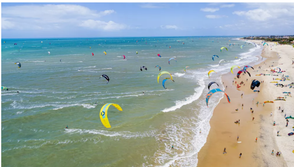
Kitesurfers riding together on Cumbuco Beach.

Sustainable Hotels on Cumbuco Beach: Cumbuco Beach is famous for its kitesurfing activities and beautiful beaches. Many local hotels and resorts have adopted sustainable practices such as recycling, efficient energy use and water conservation, helping to reduce the environmental impact of the hotel industry.