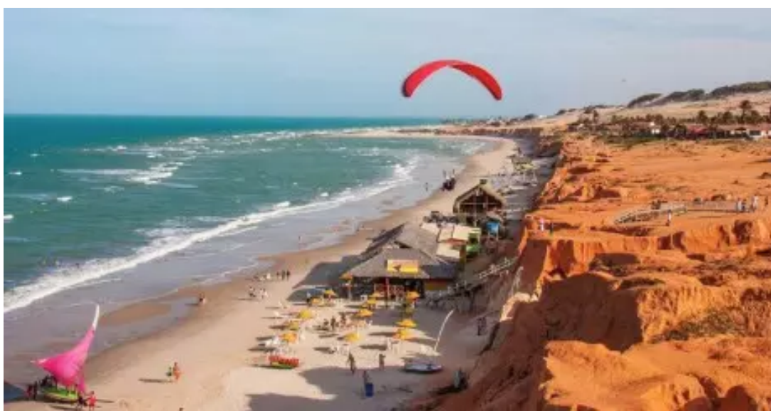
Coastline of the city of Canoa Quebrada.

In August 2023, the Brazilian Agency for International Tourism Promotion (Embratur) chose Ceará as one of the main locations to be promoted internationally, taking part in promotional campaigns in the United States, Europe and Latin America. The main reason for this was the variety of activities available that extend beyond sun and beach experiences, as well as the gastronomic delights found in various culinary hubs throughout the state of Ceará