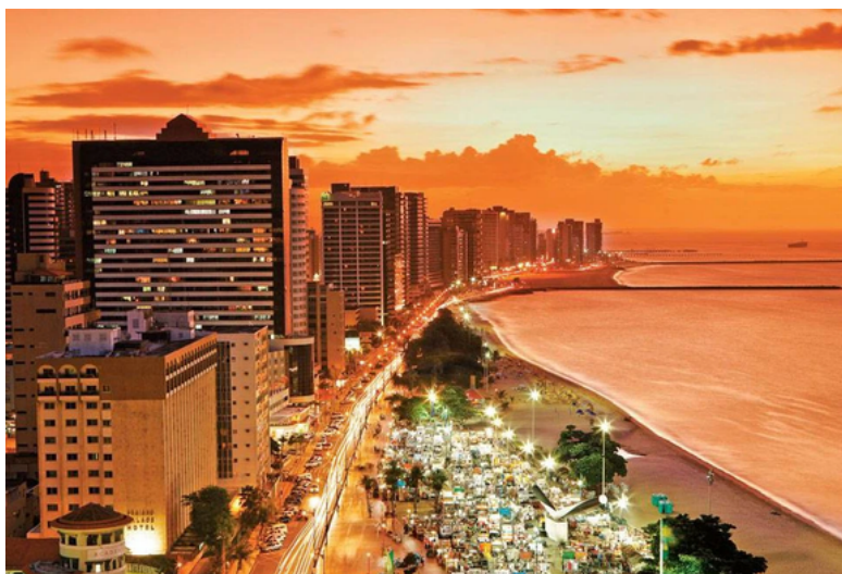
“A Praia de Meireles que se acende” by Alex Uchoa. Source: Viagem e Turismo.

Tourism also grew by approximately 4% in April when compared to March, which is above the Brazilian average. It is a sector of significant importance for the local economy and has attracted numerous tourists to various regions of the state of Ceará, maintaining a positive economic scenario and enhancing the country's prominence.